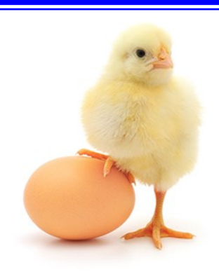
What comes first: employee engagement or great work?